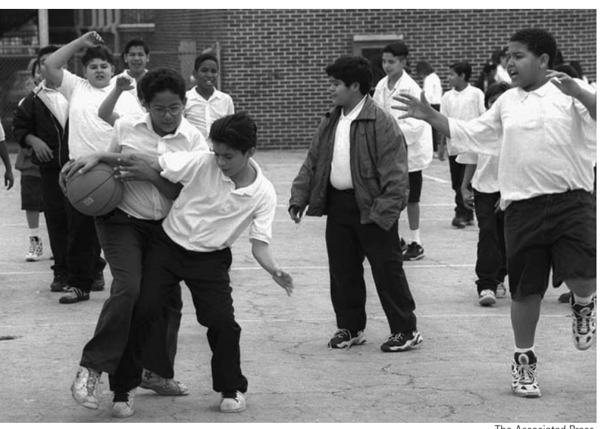
climate, eliminate gang attire, encourage students to take school seriously as their place of business, reduce friction between students from different backgrounds and level the playing field so that students are judged by what they learn and can do, not by the price of what they wear," Superintendent of Schools Carl Cohn wrote to parents.

Long Beach school officials have said uniforms were a catalyst for positive change in student behavior. "School uniforms help to improve the learning